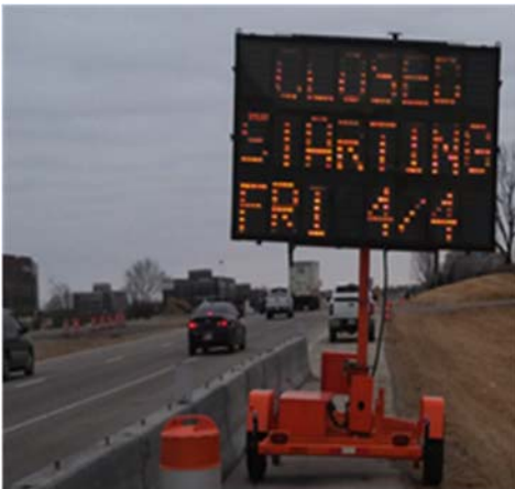
US 31 closure expected to last until Thanksgiving.

INDOT plans to close US 31 between Old Meridian Street and 136 th Street to accelerate the construction of an overpass at 126 th Street/Carmel Drive and roundabout interchanges at 131 st Street/Main Street and 136 th Street. Early utility relocations and cleared right-of-way will allow the previously planned closure of US 31 between Old Meridian Street and 136 th Street in Carmel to begin on or after April 4, 2014, and is expected to reopen by Thanksgiving.